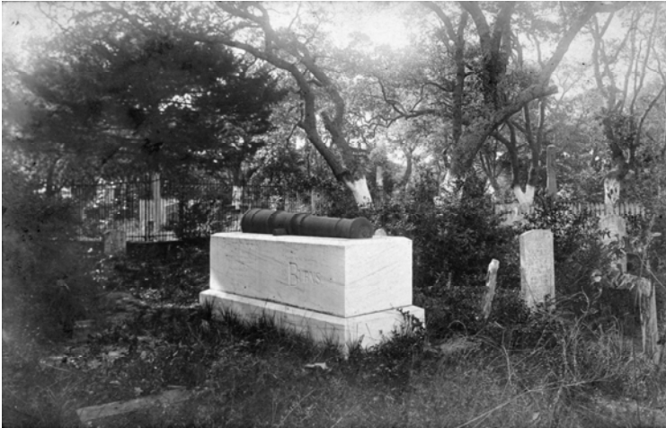
A cannon from his ship, the Snap Dragon , rests atop the grave of Otway Burns in Beaufort. The monument was unveiled on July 4, 1901. Image by M.B. Gowdy, of Beaufort, courtesy of the State Archives, North Carolina Office of Archives and History.

County in the state legislature from 1821 to 1835 (seven terms in the house and four in the senate).