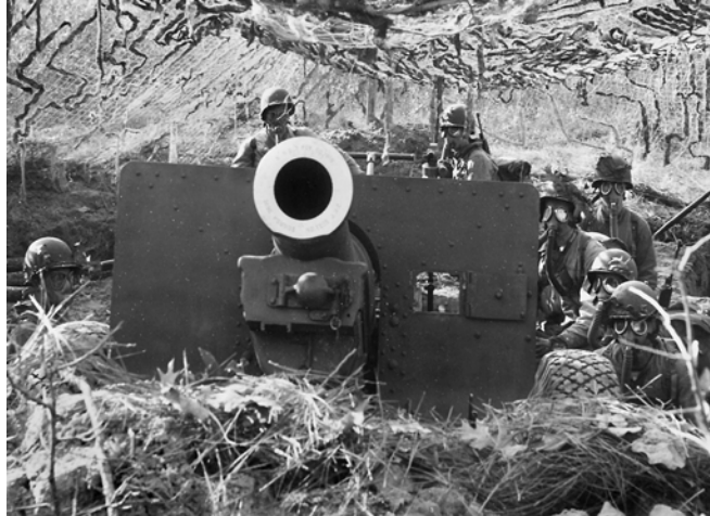
(Right) Soldiers training at Fort Bragg's Field Artillery Replacement Center practice shooting a 155-millimeter howitzer, wearing gas masks and hiding within a camouflage net.

to carry airborne troops to battle. And Greensboro's Army Air Force Basic Training Center (later the Overseas Replacement Depot) provided thousands of trained personnel, turning a southern textile manufacturing center into an "army town." North Carolina became a national defense powerhouse, training more troops during the war years than any other state. More than fifty defense-related bases and camps dotted the state, all with a major and lasting economic impact, although some closed soon after the war.