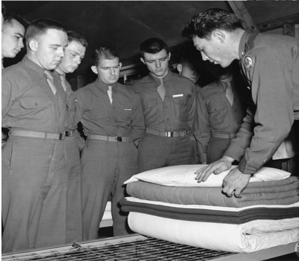
(Left) New arrivals at the army's Anti-aircraft Artillery School at Camp Davis learn about "vertical bed making" and "putting bedding on line," or stacking it properly.