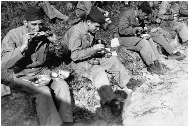
Camp Lejeune marines take a training break to enjoy their Thanksgiving meal.

Men working on military construction projects or related defense work became eligible to be drafted into the military during 1940. After America entered the war in December 1941, more and more workers were called to service. In some cases women replaced the men, working on new military bases or in defense industries. This was especially true at places like the North Carolina Shipbuilding Company in Wilmington, where women became an important part of the workforce, welding together steel plates, riveting deck plates, and doing other tasks thought of as “men’s work.”