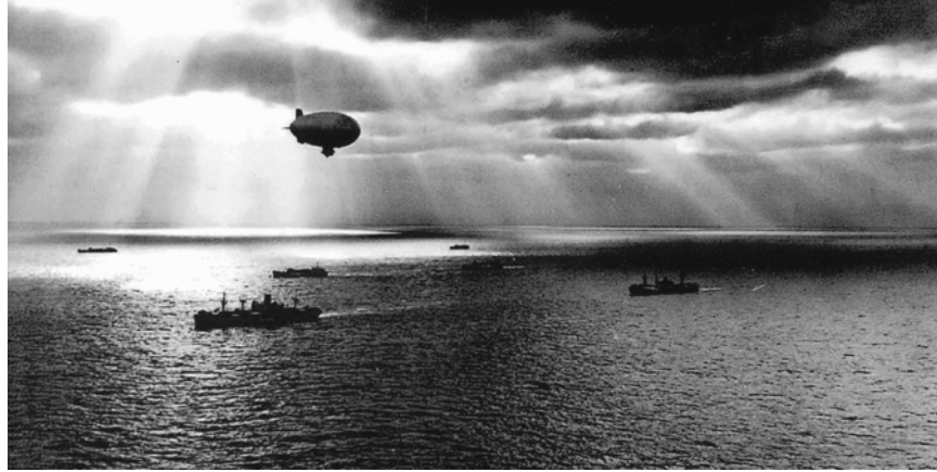
A U.S. Navy blimp flies over a convoy of ships to protect it from German U-boats.

As the years have passed, most of the physical evidence of World War II U-boat encounters off North Carolina's coast has vanished. Submerged off the state's beaches are the remains of at least 60 ships and countless unexploded torpedoes, depth charges, and contact mines. Even today, small patches of blackened sand offer reminders of the massive oil spills of 1942. On Ocracoke Island and at Cape Hatteras, cemeteries contain the graves of six British sailors who perished in North Carolina's waters. Many people living in the state don't know about the time when war came so close. But older Tar Heels who lived on the coast back then remember. In fact, they would love to tell you about it.