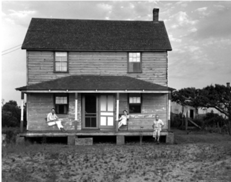
"We'd hear these explosions most any time of the day or night, and it would shake the houses," one Outer Banks resident remembered about the U-boat attacks during World War II.

The greatest concentration of U-boat attacks happened off North Carolina's Outer Banks, where dozens of ships passed daily. So many ships were attacked that, in time, the waters near Cape Hatteras earned a nickname: "Torpedo Junction." U.S. military and government authorities didn't want people to worry, so news reports of enemy U-boats near the coast were classified, or held back from the public for national security reasons. For many years, most people had no idea how bad things really were. But families living on the Outer Banks knew—they were practically in the war.