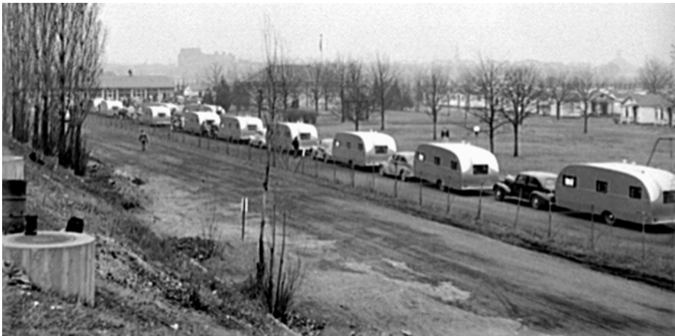
A caravan of fifty trailers—on its way to provide temporary housing in Wilmington—stops for the night outside Washington, D.C. Work in building ships and in other wartime industries brought lots of people from surrounding areas into North Carolina towns.