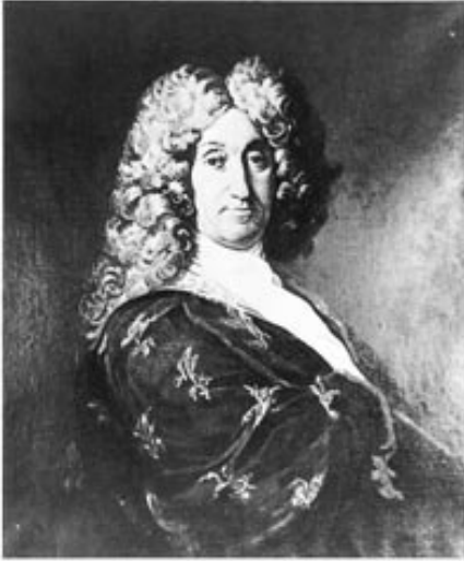
Baron Christoph von Graffenried.

The settlement of New Bern may have sparked the Tuscarora Indian War (1711–1714), in which the Tuscarora Indians were defeated. Immigration to the middle Coastal Plain increased afterward because the war reduced the threat of Indian attacks on settlers.