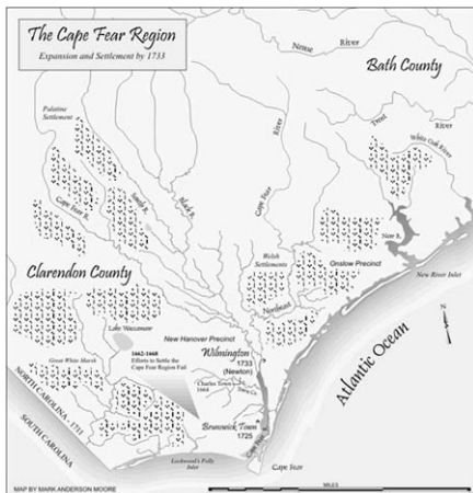
Expansion and settlement in the Cape Fear region by 1733.

The settlers from South Carolina were fleeing economic depression, high taxes, and political unrest in their colony. Other settlers came from England, Scotland, and Ireland as well as the colonies of Massachusetts, New York, Pennsylvania, and Maryland. Some traveled on a new one-hundred-mile road between the Neuse River and the Cape Fear River.