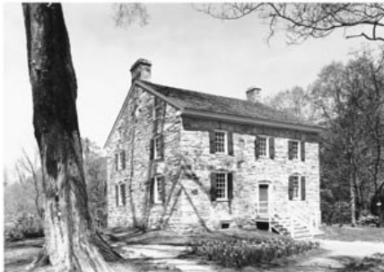
Hezekiah Alexander House (1774), Mint Museum of History, Charlotte. Hezekiah Alexander owned as many as thirteen slaves, a number that placed him in the top 1 percent of slaveholders in late eighteenth-century Mecklenburg County. Alexander's labor force was the simple fact that accounted for the difference of scale between his "Rock House" and the more modest dwellings of nonslaveholders.

Settlers of English descent also came into the Piedmont. Two groups concentrated in the northern part. By 1754 English Quakers had organized the New Garden Monthly Meeting. This congregation attracted settlers from several counties in the Piedmont. The other English group included settlers from central Virginia, mostly Baptist, who arrived during and after the French and Indian War (1754–1763).