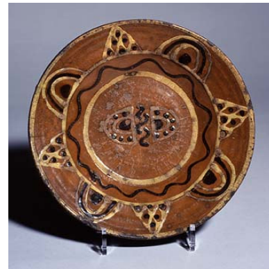
This dish in the museum's collection, made between 1775 and 1820, is probably Moravian. Moravians were well known for their pottery, which today is highly collectible.

Many of the German settlers clustered together and preserved their native language in homes, churches, and schools. German publishers prospered in Salisbury and in Salem. Gradually many of the settlers adopted English-sounding names and switched to speaking the English language.