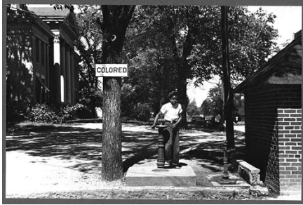
A separate drinking fountain on the county courthouse lawn, Halifax, 1938.

The Tar Heel State also began to pass Jim Crow laws that required segregation, or separation of different races. On buses, in theaters, at restaurants, and in other public places, African Americans could not sit with Whites. Instead they were forced to sit in separate sections. They had to attend separate schools, which were usually underfunded. They were not allowed to work at the same jobs as Whites.