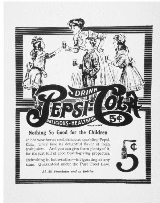
Early posters (ca. 1900–1910) for Pepsi-Cola, which was invented in a New Bern drugstore in 1898, pushed its health benefits.

There are several reasons why an inventor may not be widely known. He or she may have created something intended for personal or local use, only. He or she might be employed by an industry in which inventions are kept as trade secrets, helping one business, or be part of ongoing work involving so many people that we do not know all of their names. An inventor might be unable to afford the complicated and sometimes lengthy process of